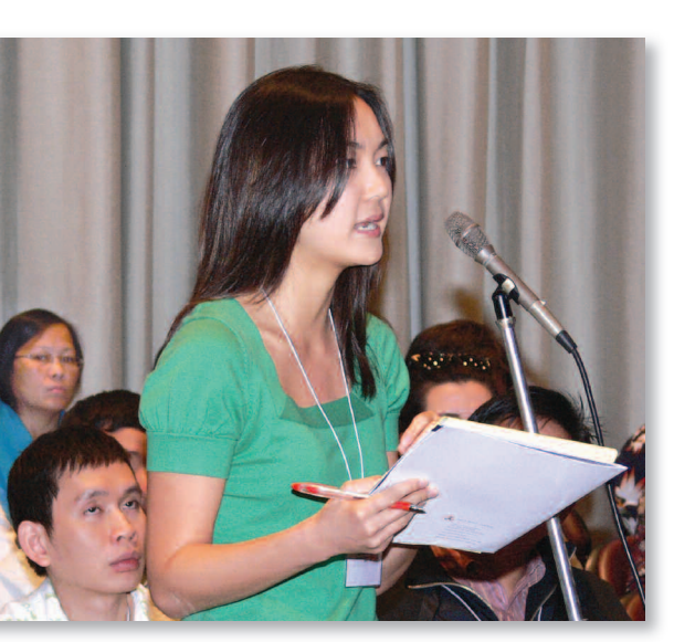
The International Graduate Student Conference, an annual student-led initiative and the largest of its kind worldwide, attracted 140 students from 54 universities in 25 nations.

In FY2009 the number of EWC students rose to 540, the highest since 1974. This was driven by a growing variety of public and private scholarship funding streams, with total of 14 at present, including the first from the Norway Research Council, supporting Pacific islands students, and the Ministry of Education and Training in Vietnam. An increasing number of students also fund