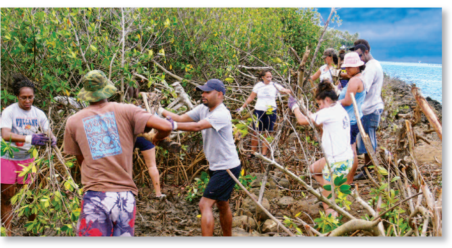
U.S.-South Pacific Scholarship Program alumni helped restore a Native Hawaiian fishpond during their week-long leadership and social networking workshop in Honolulu.

their own participation in East-West Center programs as affiliated students and scholars, to access the rich intellectual and cultural environment at the Center. The chart below depicts student diversity by region.